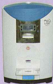
Yamada 838 RO.UV Hot & Cold