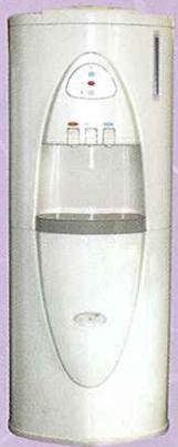
NWD CA929 Hot & Cold