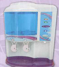
NWD 389-03 Normal, Warm & Hot