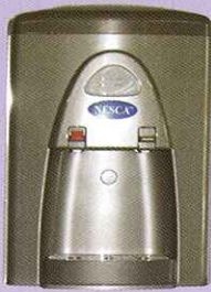
NWD 528 Hot & Cold