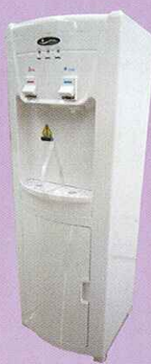
IL 688-01 Hot & Cold Sizes (mm): 340X 330 X 950