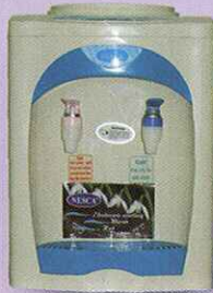
NWD 370 Hot & Warm