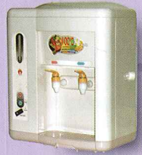
NWD AP-8998 Hot & Warm