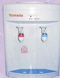
NWD 389-06-HW Hot, Warm & Normal