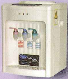
NWD 369 Hot & Warm