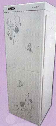
IL 688-02 Hot & Cold Sizes (mm): 345 X 330 X 970