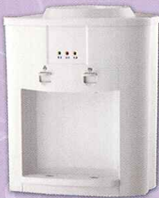
NWD 389-13-HW Hot, Warm & Normal