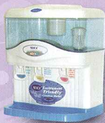
NWD 389-01 Normal, Warm & Hot