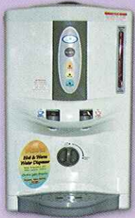
IL 688 Hot & Cold