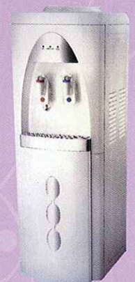
IL 688-04 Warm & Cold Sizes (mm): 360 X 400 X 990