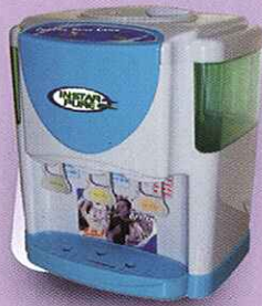
IP 99 Hot, Warm & Normal