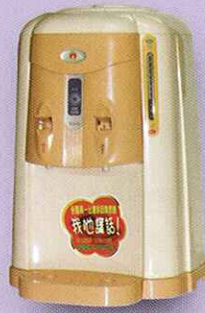
NWD 8988 Hot & Warm