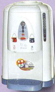
NWD AP-906 Hot & Cold