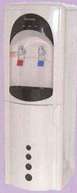
NWD 1011 Hot & Cold Sizes (mm): 360 X 350 X 990