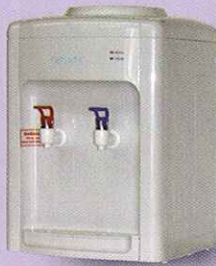
NWD 3001 Hot & Cold