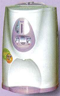
AP 757 Hot & Warm