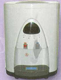
Yamada 919 RO.UV Hot & Cold