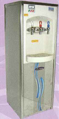
NWD 1308 Hot, Cold & Warm