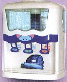
NWD 389-04 Normal, Warm & Hot