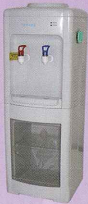
NWD 1010 Hot & Cold Sizes (mm): 390 X 390 X 900