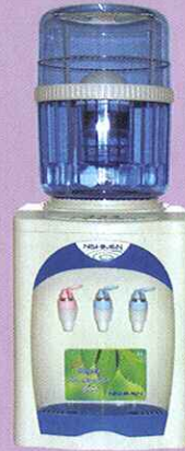
NWD 389-05 5 Steps Filtration Hot, Warm & Normal