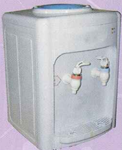
NWD 389-12-HW Hot, Warm & Normal