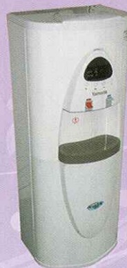
YMP 929 RO.UV Hot & Cold