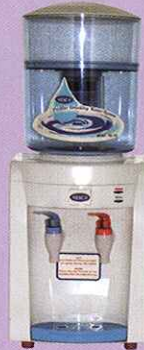
NWD 168 5 Steps Filtration Hot, Warm & Normal