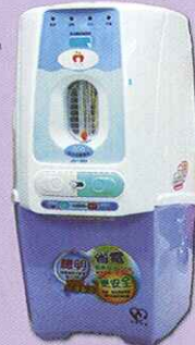
NWD AP-9688 Hot & Warm