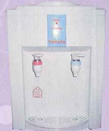
NWD 389-08-HW Hot, Warm & Normal