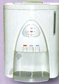
CA 919 Hot, Cold & Warm