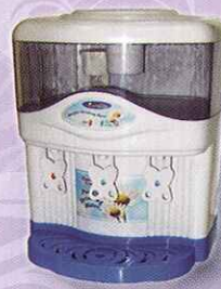
NWD 389-02 Normal, Warm & Hot