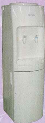
NWD 1013 Hot & Cold