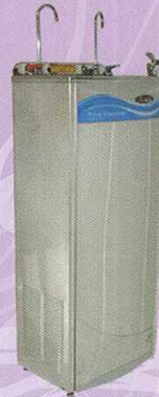
NWD 700 Hot & Cold