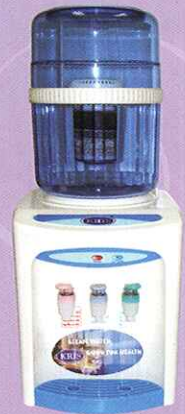
NWD 389-07 5 Steps Filtration Hot, Warm & Normal