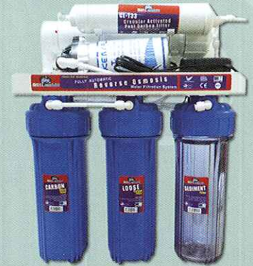
50 GPD Undersink Quick Joint Housing