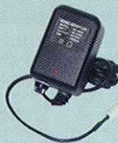
Booster Pump Adaptor AC-AC