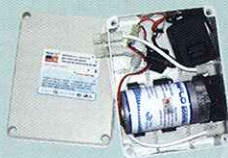
Booster Pump with case