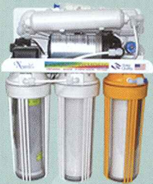
50 GPD Undersink Colour Housing