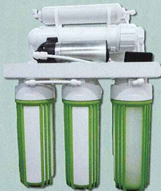
50 GPD Undersink Colour Housing