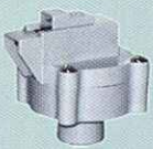
Low Pressure Valve(EZ)