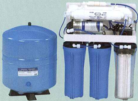
50 GPD Undersink (standard)