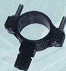
Drain Connector -EZ