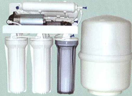
50 GPD Undersink (deluxe)