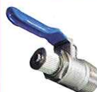
1/4" With 1/2" RO Joint