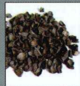
Oil Palm Shell