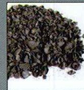
Oil Palm Shell Charcoal