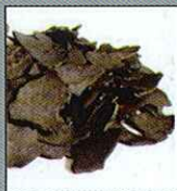
Coconut Shell Charcoal