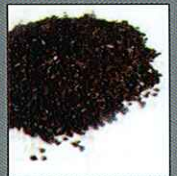
Oil Palm Shell Activated Carbon

貝康清隆碳科技有限公司 Nikom Carbon Technology Sdn. Bhd. (691210-M)