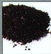
Coconut Shell Activated Carbon