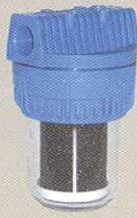
5" B Filter Housing