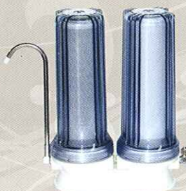
10" Double Filtration System - Clear