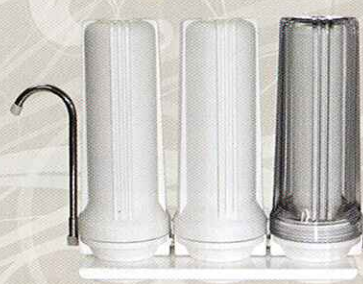
10" Triple Filtration System