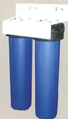
20" Double Big Flow Filter Housing - Blue