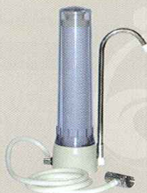
10" Single Filtration System CTC 1000