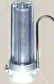
10" Single Filtration System - Clear