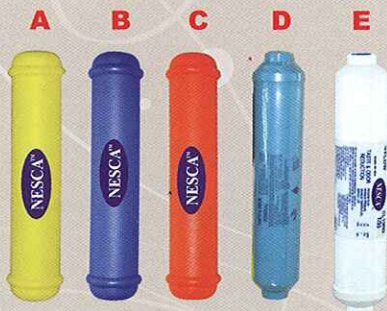
CLT 33 Series