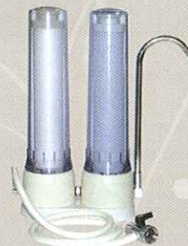
10" Double Filtration System CTC 1000