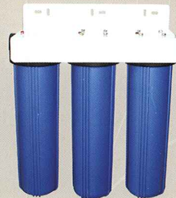
20" Triple Big Flow Filter Housing - Blue