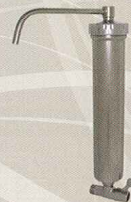
10" Stainless Steel B-0088