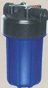
10" Big Flow Filter Housing - Blue